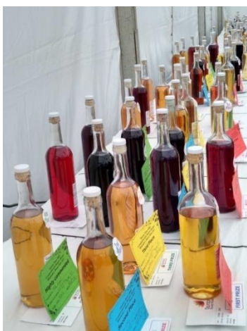
A Kaleidoscope Of Wine!

In July along with my wife I attended the Party in the Park organised to celebrate the finish of Somerset's 2020 Festival to the Grand Charity. Originally scheduled for June 2020 as a Celebration Lunch at Ashton Court it had to be cancelled due to the Covid Pandemic and was rescheduled for July 2021 as an evening Party in a Park event at Taunton School only to be postponed for a further year. However, this summer it finally happened and over 420 people enjoyed an evening of good company, good food and great musical entertainment provided by the legendary 'Wurzels' and I must admit to joining in with the singing. Luckily, so did everyone else so my out of tune voice mercifully went unnoticed. The whole evening was finished off with a Laser and Firework display.