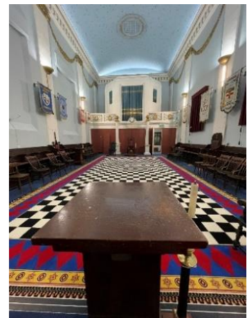
The view from the East

When printing off the dining plan I caught a glimpse of the name W Bro B Russells, but I had no idea who it was and as Bro Mike Marshall had invited pretty much everyone from the Somerset Province, I just assumed it was someone he knew or a spelling mistake!