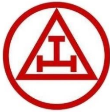
Holy Royal Arch